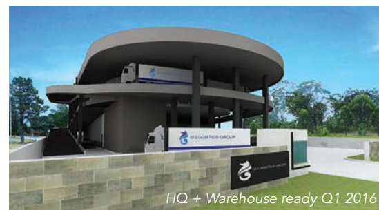
HQ + Warehouse ready Q1 2016